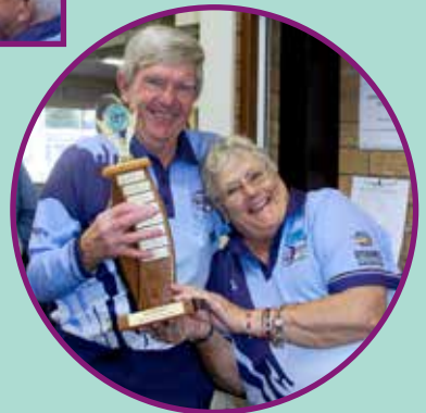
Our Men's and Ladies' Captains looking happy after a great afternoon of bowls