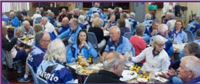
A great turn out of members with lovely weather and great food